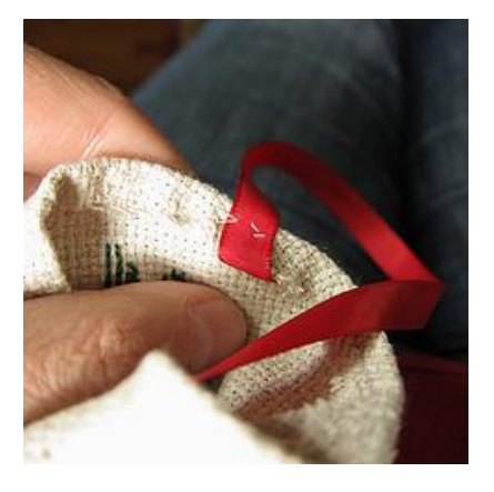
10) Fill the cone and hang!

9) Hand or machine sew down. Bring the ribbon back up over the seam allowance and tack into place.