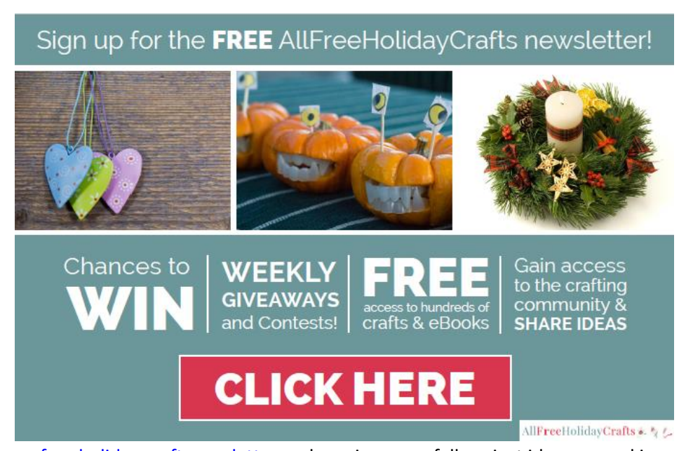
Sign up for our free holiday craft newsletter and receive more fall project ideas, pumpkin craft tutorials, crafting tips, and more – straight to your inbox every week.