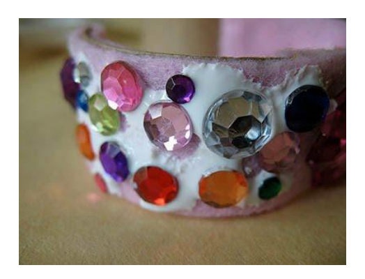
5) Allow to dry completely and wear!

4) Use a generous amount of white craft glue to cover the outside of the bracelet with craft jewels.