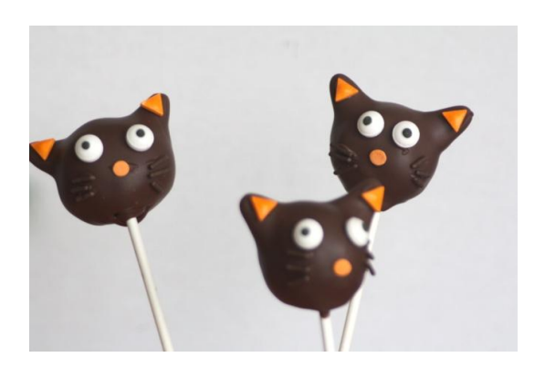
10) Add orange triangles for the inside of the ears, long chocolate sprinkles for whiskers, and an orange candy sprinkle to make the nose.

9) Decorate the face with candy eyes, using a toothpick to dab melted chocolate onto the cake pop where you want to add the candy pieces.