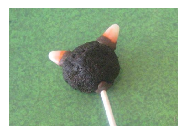
8) When the ears are firmly attached dip the cake pops in melted chocolate; refrigerate for 15 minutes.

7) Take two pieces of candy corn and chop off the flat end to shorten them. Use a toothpick dipped in melted chocolate to attach your candy corn to the cake pop and create the ears.